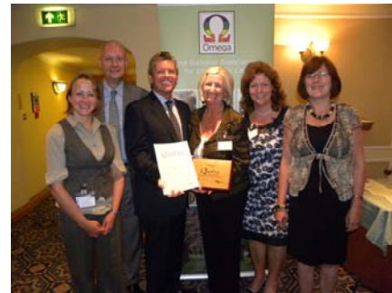
Staff from Springhill Care Home, Lancs, who were awarded beacon status

PCTs can request a similar audit direct from Omega ( ada@omega.uk.net )